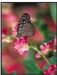
Wildflower Seeds Sold 13

The rental rate for the drill is $12 per acre with a $100 deposit. Interested renters can contact the District today to inquire about renting.