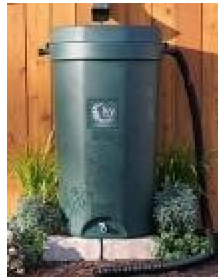
Ivy Rain Barrel Sold 7