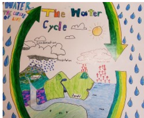
1st Place-5th grade poster

Durham Soil & Water Conservation District would like to thank all the schools, teachers and students who participated in all of our education programs!