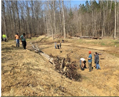
Northern High Students Planting Buffer