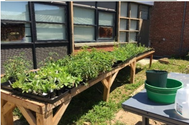
Pictured above: Northern High School Pollinator plants