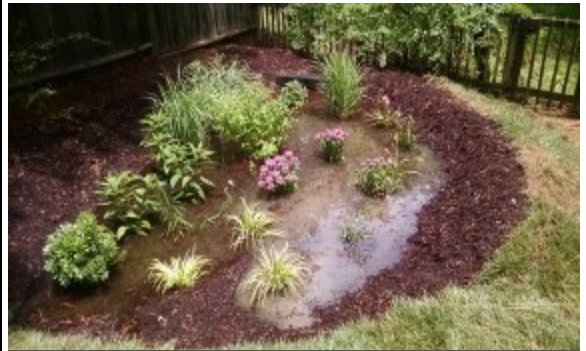
CCAP Rain Garden in Action