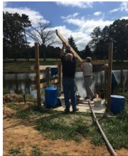
AgWRAP pump work

Similar to the NC Ag Cost Share Program, once an AgWRAP contract has been signed and approved the producer has 2 to 3 years to complete the installation of all BMPs. During FY 2018, District staff worked to assist producers with the construction and completion of 4 AgWRAP best management practices that were contracted in FY 16 and 17. District staff also oversaw the construction and completion of 6 best management practices that were funded as part of a NC Foundation of Soil and Water Conservation special grant. All together the following best management practices were installed in FY 18; 4 microirrigation pump & filters, 4 acres of microirrigation tubing and 2 ag wells for crop irrigation.