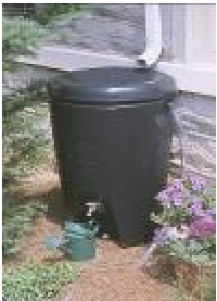
Moby Rain Barrel Sold 6

All proceeds go toward Environmental Education . FY2017– the district sold the following items: