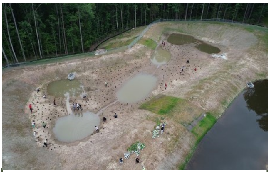
Picture taken with a drone of Northern High School students planting the wetland