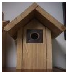
Bird Houses Sold 3