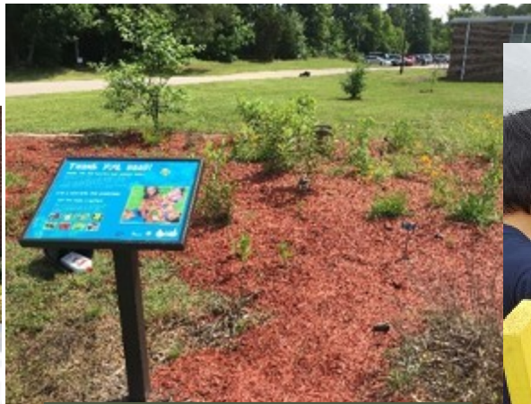
Pictured above: Lowes Grove Middle School Pollinator bed and pictured right: Lowes Grove Middle School students