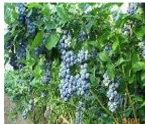
Tree & Shrubs Sold 195