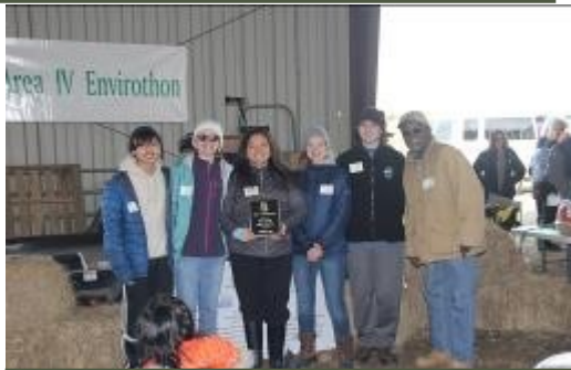
Killer Kudzu High School team from Durham placed 2nd at the Area IV Envirothon

Durham was represented by 10 teams of high and middle school students at the event. Of the 10 teams, 4 placed in the top seven (earning them a spot at the statewide competition in April). The Killer Kudzus team from the NC School of Science and Mathematics placed 2 nd overall. The other 3 teams were the Hellgramites and Cypress Knees, also from the NC School of Science and Mathematics, and the Creek Squad, a homeschool middle school team.