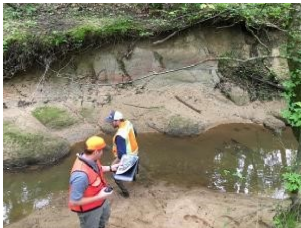
Pictured right: before restoration

approximately 8 acres in size. The project will generate a reduction of 901 tons of sediment, 529 pounds of total Nitrogen and 34 pounds of total Phosphorus from entering