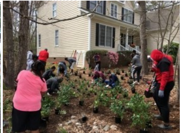
Students & teachers participating in the BETC program install a downspout disconnection and a critical area planting