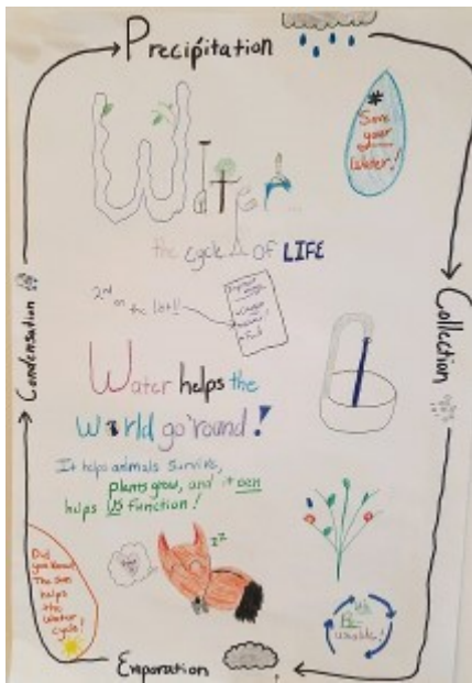
1st Place-4th grade poster

Durham Soil & Water Conservation District would like to thank all the schools, teachers and students who participated in all of our education programs!