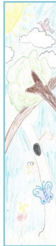
1st Place-1st grade bookmark

The 1st place winners received a trophy and $50. 2nd place winners received a certificate and $25. Teachers of 1st place winners also received a cash reward for their participation. These contests are part of a statewide event sponsored by the NC Association of Soil and Water Conservation Districts. 1st place winners from Durham advanced to an area-level contest, where we had a number of Durham entries place and take prizes.