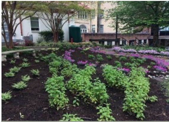
NCSSM cistern irrigating critical area planting