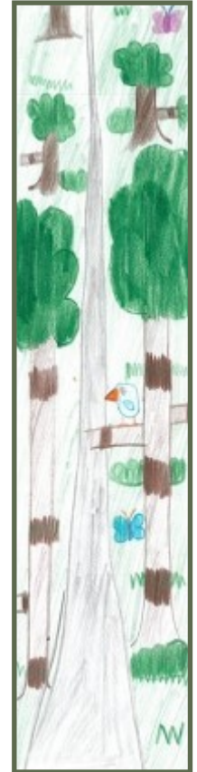
1st Place-2nd grade bookmark